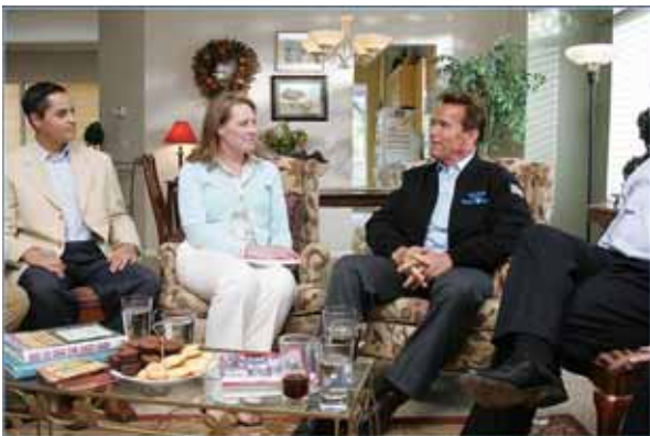
Gov. Schwarzenegger has a "kitchen cabinet" meeting in Santa Rosa on April 8, the same day he withdrew his plan to reshape California's public employee pension system.

The legislature is also considering propositions on doctor-assisted euthanasia and universal-type health insurance plans. Also, a constitutional amendment requiring abortion providers to notify the parent or guardian of minors 48 hours before performing an abortion is close to qualifying for the fall election.