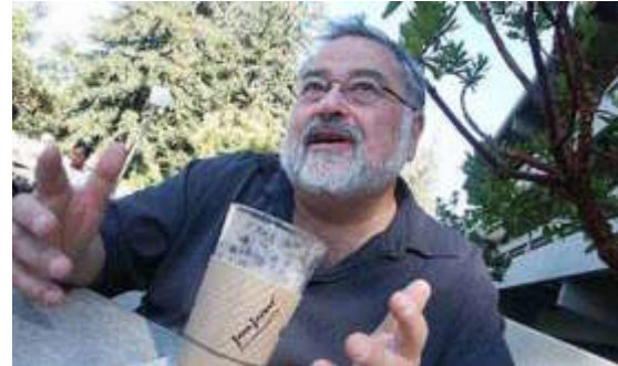
UC Berkeley linguistics professor and author George Lakoff at the Free Speech Movement Café.

We can examine how fairly he presents the conservative