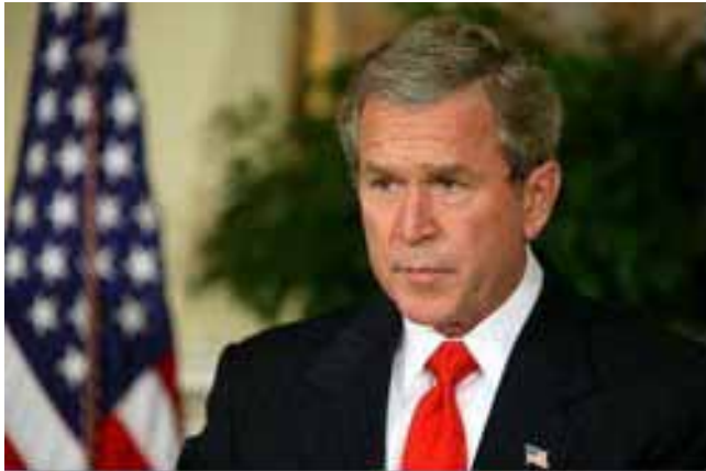
In a speech on February 24, 2004, President George Bush called for the Federal Marriage Amendment.

This is the beginning of a letter sent to the members of the Congress of the United States on March 2, 2004. The League of Women Voters, along with 30 other organizations, is a member of the LCCR.